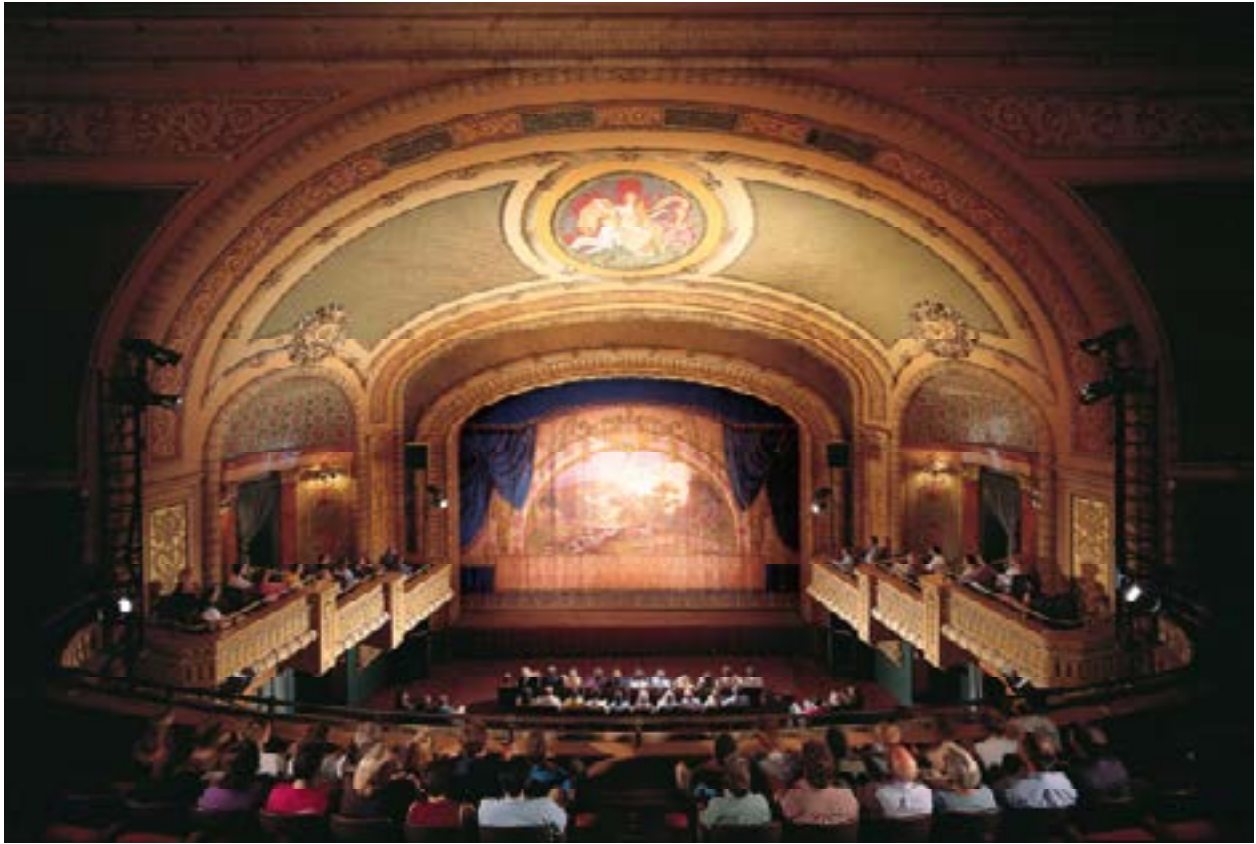
The Interior of The Paramount Theatre